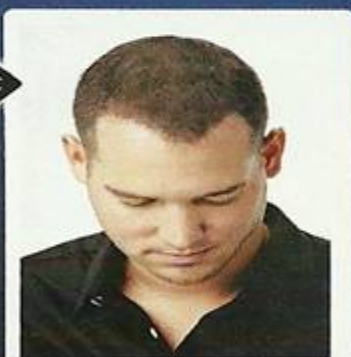
30 SECONDS LATER