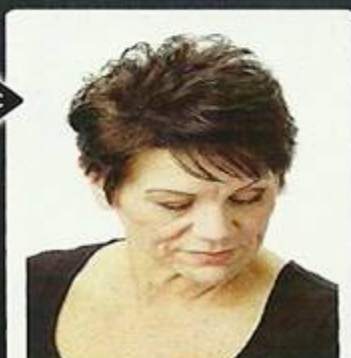
30 SECONDS LATER